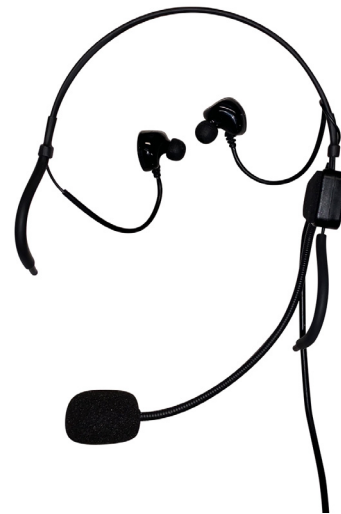
CHS-HHLTL-DMG Hard Hat Headset

CrewPlex, LLC 205 Technology Parkway Auburn, Alabama 36830 USA www.crewplex.com Phone +1.334.321.1400 Fax +1.334.321.1162